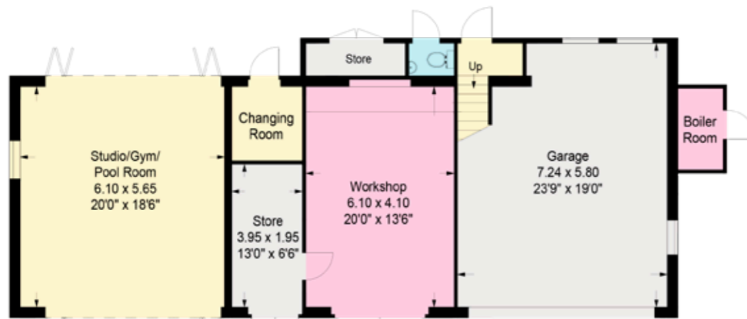
Ground Floor (Coach House)