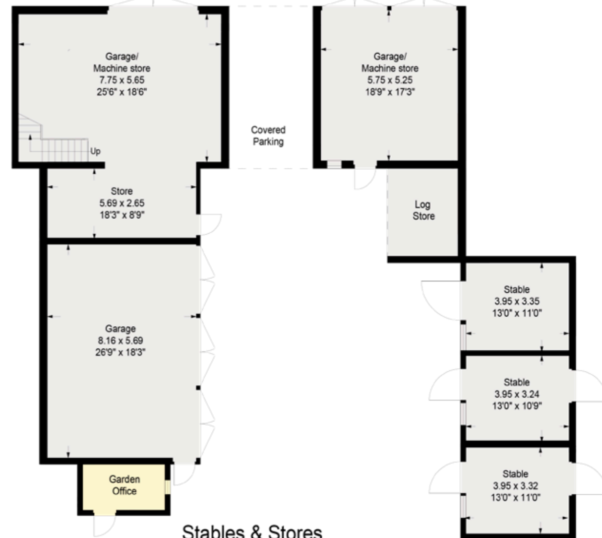
Stables & Stores